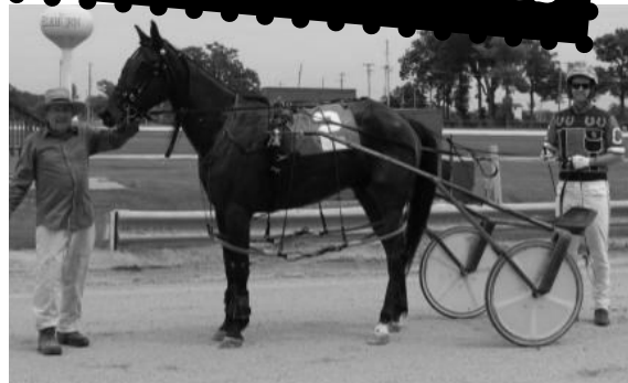
SPRIT IN THE SKY Pacer of the Year