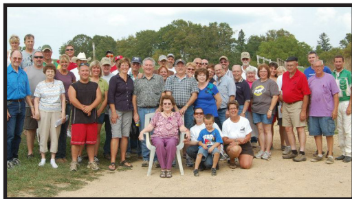
Iowa County Horsemen In appreciation for continuing to provide a successful racing program in Mineral Point